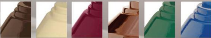
Gnome and Parlour are available in porcelain enamel and painted finishes.

Painted (Metallic Finish): Black, Blue, Moss Green, Brown, Honey Glow Brown Painted (Matte Finish): Satin Black, Forrest Green, Golden-fire Brown (Custom Painted Color Matching Available at Additional Charge) Porcelain Enamel: Ebony Black, Ivory, Burgundy Red, Majolica Brown, Thelin Green, Cobalt Blue